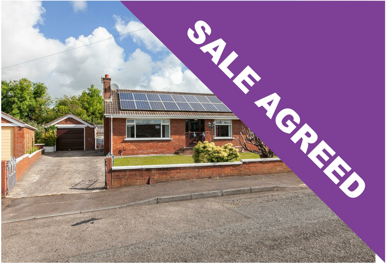
29 Loral Park, Newtownabbey, BT37 0LH